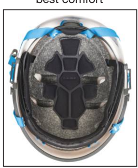
NEW BACK ADJUSTMENT WHEEL SYSTEM (Vertical adjustment also)